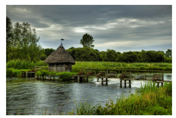
Leckford eel traps

The river rises in the village of Ashe, and flows west through the villages of Overton, Laverstoke, and the town of Whitchurch, before joining with the Bourne Rivulet at Testbourne and turning into a more southerly direction. It then flows through the villages of Longparish and Middleton to Wherwell and Chilbolton, where the Rivers Dever and Anton contribute to the flow.