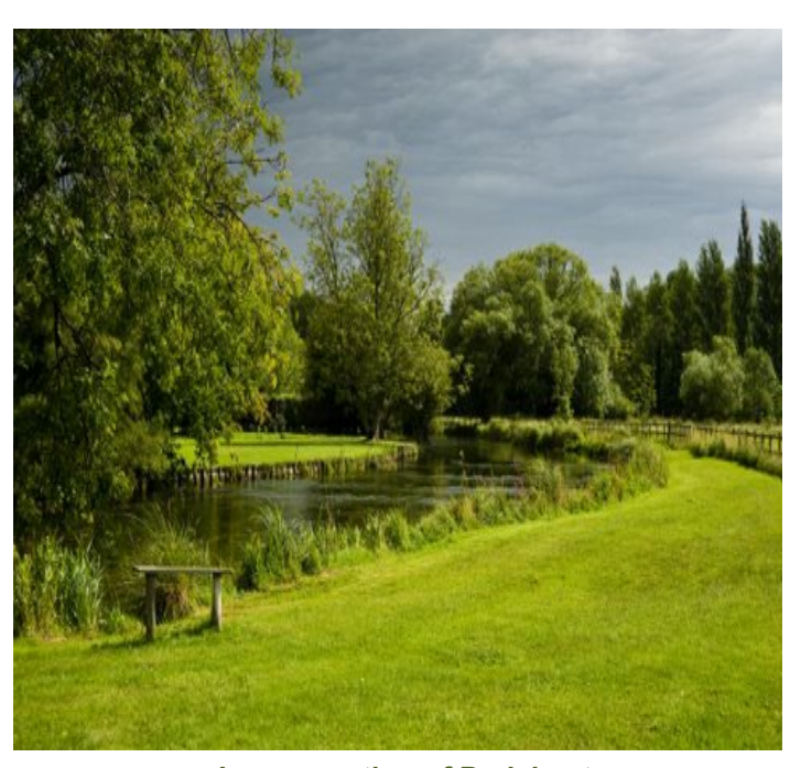
Lower section of Park beat

Make your way downstream through the garden (I know it is a bit disconcerting!) until the path narrows again and you come to hatches and a pool. Keep left to follow the left bank to another gate.