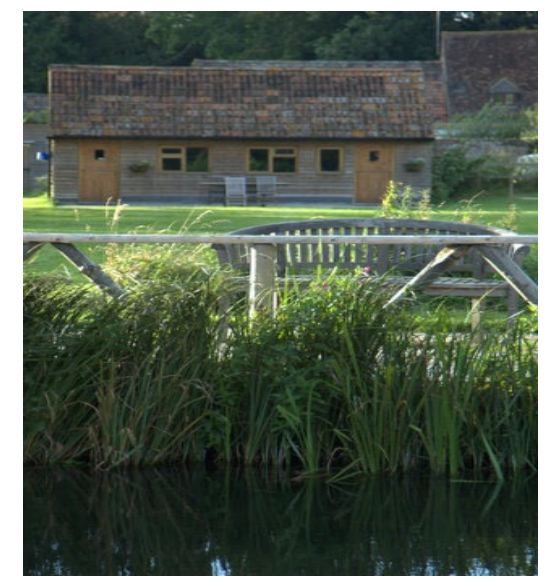
Priory cabin from river

The cabin is just slightly over half way up the beat; as you stand in front with the cabin to your back the river is at the end of the mown grass. There is a seating area by the river which is a good place to see the river and relax when you first arrive.