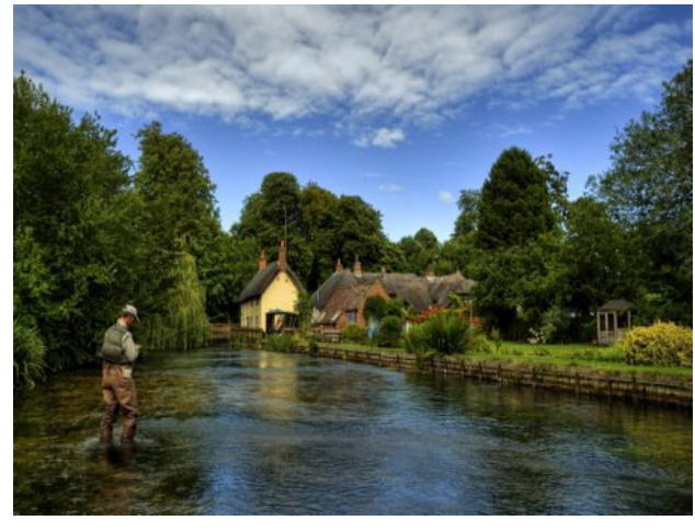
Park garden/wading section

As you return to the garden section, please note that no fishing from the bank is permitted. Only anglers may enter the garden and no dogs permitted. However, you are very welcome to wade (see hatched area on map) and I can tell you that this is great for small, wild fish.