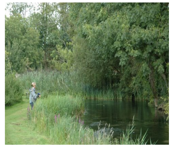
Start of Priory beat

To a great extent I would repeat my advice for the Park beat on how to fish as this is classic sight fishing and as such there are no particular areas or spots that I would single out for attention. Just move upstream slowly, keeping your eyes peeled; the fish are generally steady surface feeders and easy to locate.