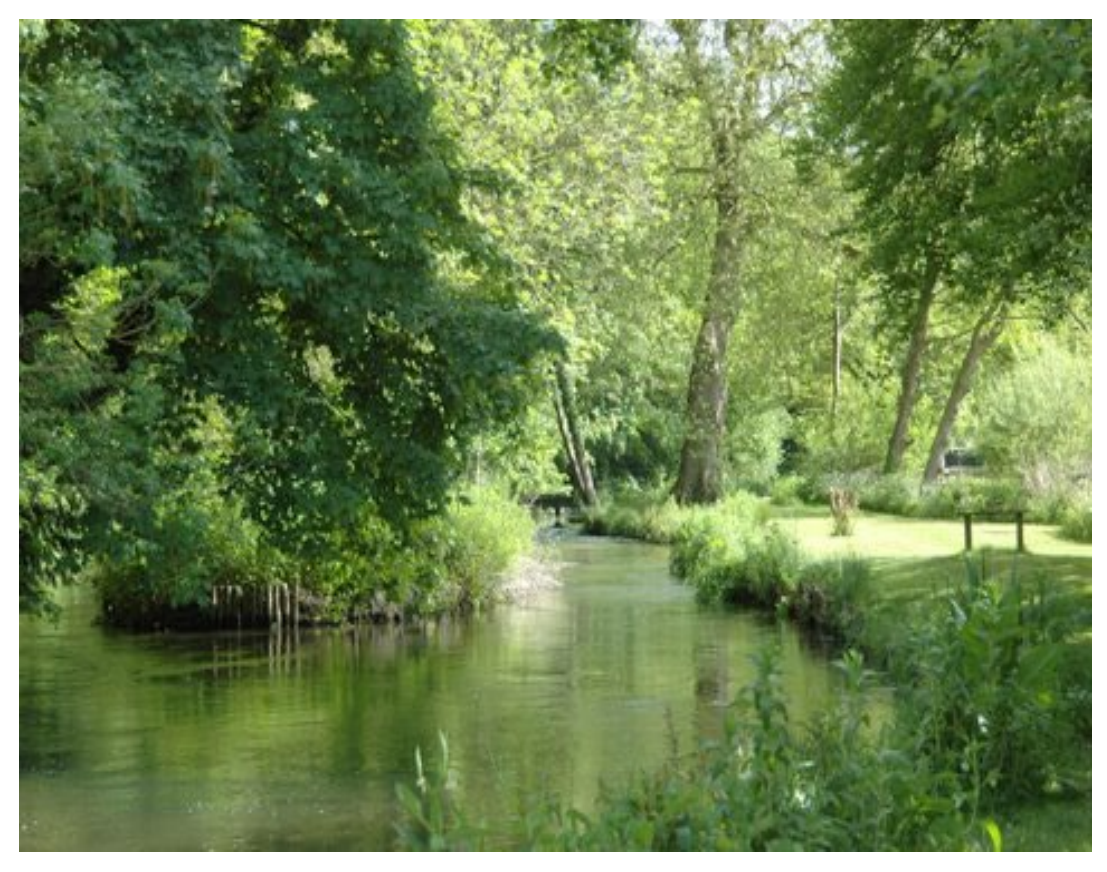
Second island with view to top of Park beat

The Park Beat cabin is fully equipped and there is a WC for fishers located near the offices (see map for details).