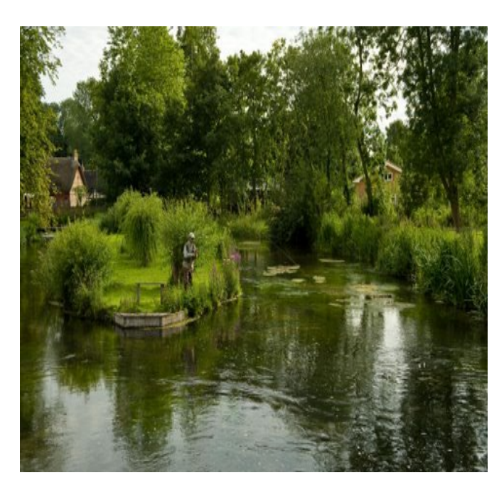
Island opposite Park cabin

Back on the concrete path, over the road and through the first garden (no fishing please) brings you back to the cabin. Here you have the option of fishing from the island; the pool at the top is fantastic.